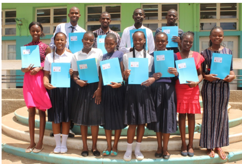
A majority of female excellence: BEBUC-scholars from Lubumbashi after the solemn ceremony.