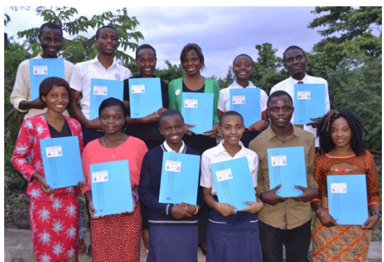
Happy about their prolonged or newly granted scholarships: The BEBUC scholars of Goma.