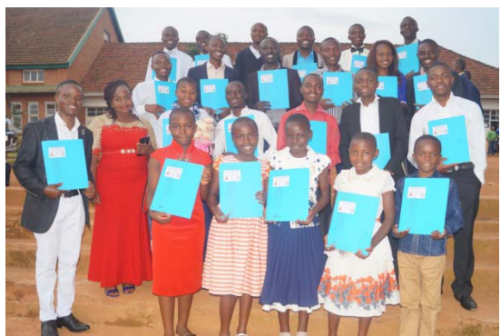
After their successful interviews: The BEBUC scholars from meanwhile six institutions in Butembo and from Kisangani.

The latest BEBUC evaluation had taken place in the west of the Democratic Republic of the Congo, in its capital Kinshasa, in June 2016. Now, in the course of a big evaluation trip, it was the turn of the other 16 BEBUC institutions – in the east, in the north, in the center, and in the south of the country.