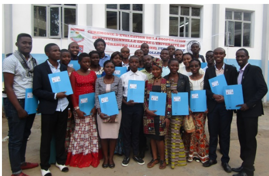
Done: The BEBUC scholars from Bukavu with their typical blue folders.