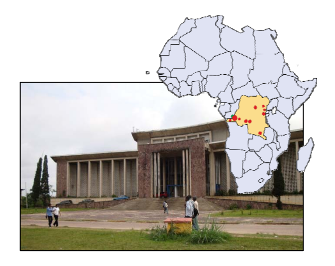
The main building of the University of Kinshasa